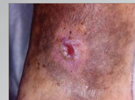
SIXTH WEEKLY DRESSING CHANGE